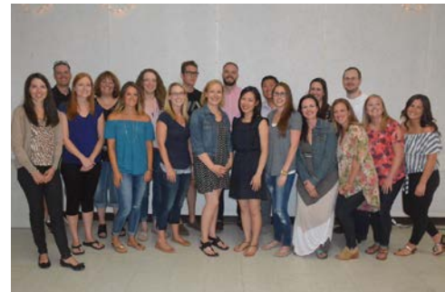
Pharmacy Class of 2007