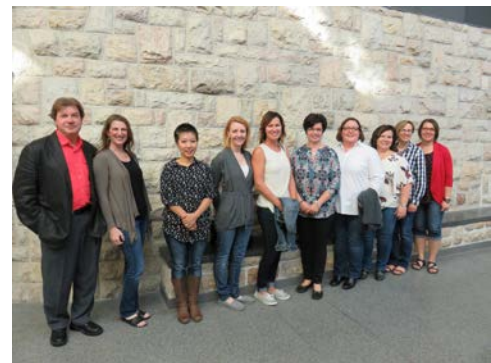
Pharmacy Class of 1997

Brooke Bulloch (BScNutr 2009) was on Global Saskatoon on Tuesday, October 17 to discuss food safety tips, including preparation and storage. Watch the video.