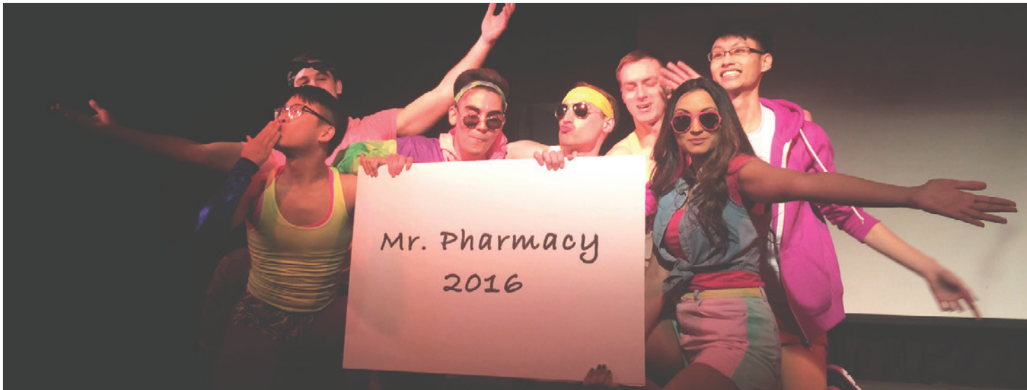
Top: PAM ribbon cutting ceremony; Bottom: Mr. Pharmacy 2016 opening dance.