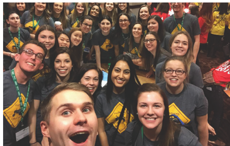
Top right: White Coat Ceremony, page 24; Top left: Third-year nutrition send-off, page 28; Bottom right: Nutrition research day, page 23; Bottom left: 2016 CAPSI Professional Development Week, page 18.