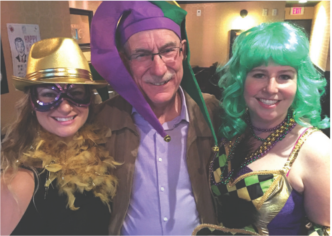
Top: Sask Night; Bottom left: Vancouver; Bottom right: Calgary.

Dates and locations for our upcoming alumni events in 2017 will be announced in our newsletter, on our website and on social media.