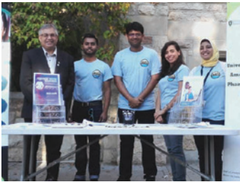
TRAINEE SPOTLIGHT APRIL AAPS Student Chapter

Nutritional care of urban and rural long-term care residents with dementia.