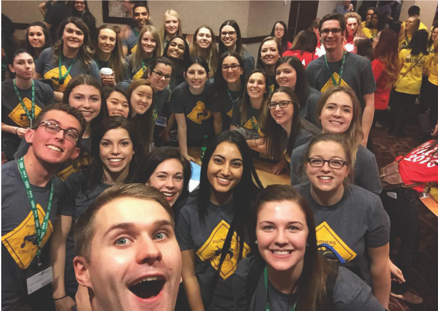
Pharmacy students at 2016 CAPSI Professional Development Week