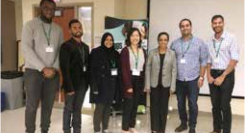
Top: AAPS Christmas party; Bottom: AAPS Visiting Scientist Day