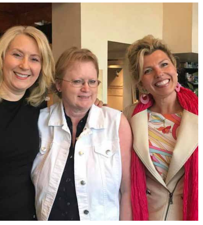
Top and bottom left: DC Conference reception; Bottom right: Sask Night.