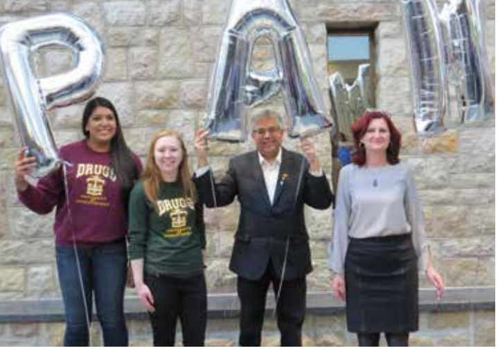
PAM ribbon cutting ceremony